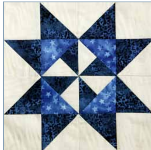
Block 1 was taken from issue #1 of Quilters Newsletter (1969) where it was identified as a Martha Washington Star block.