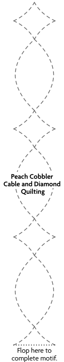
Peach Cobbler Cable and Diamond Quilting